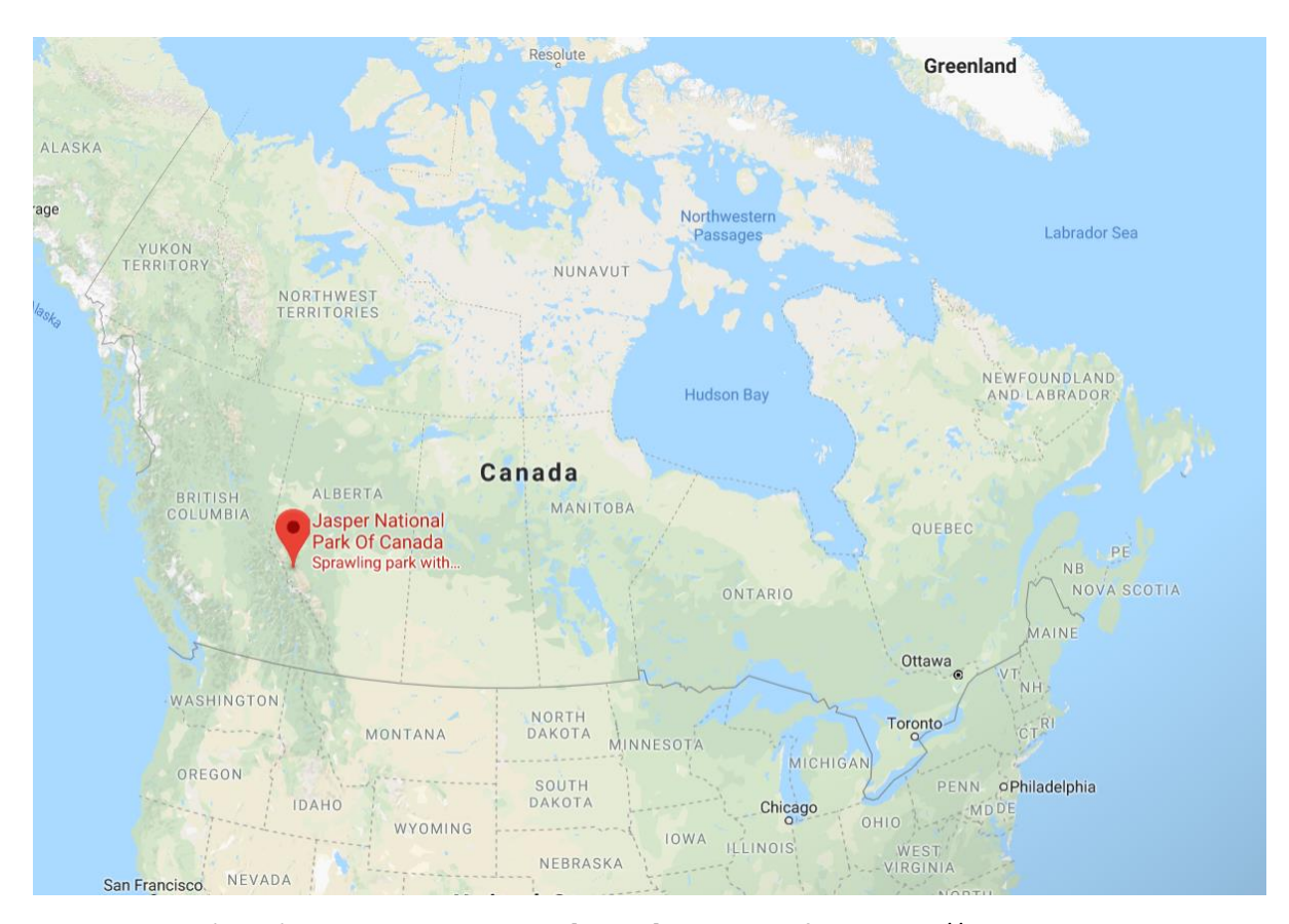
Appendix 1: Map of Canada – Jasper National Park Location