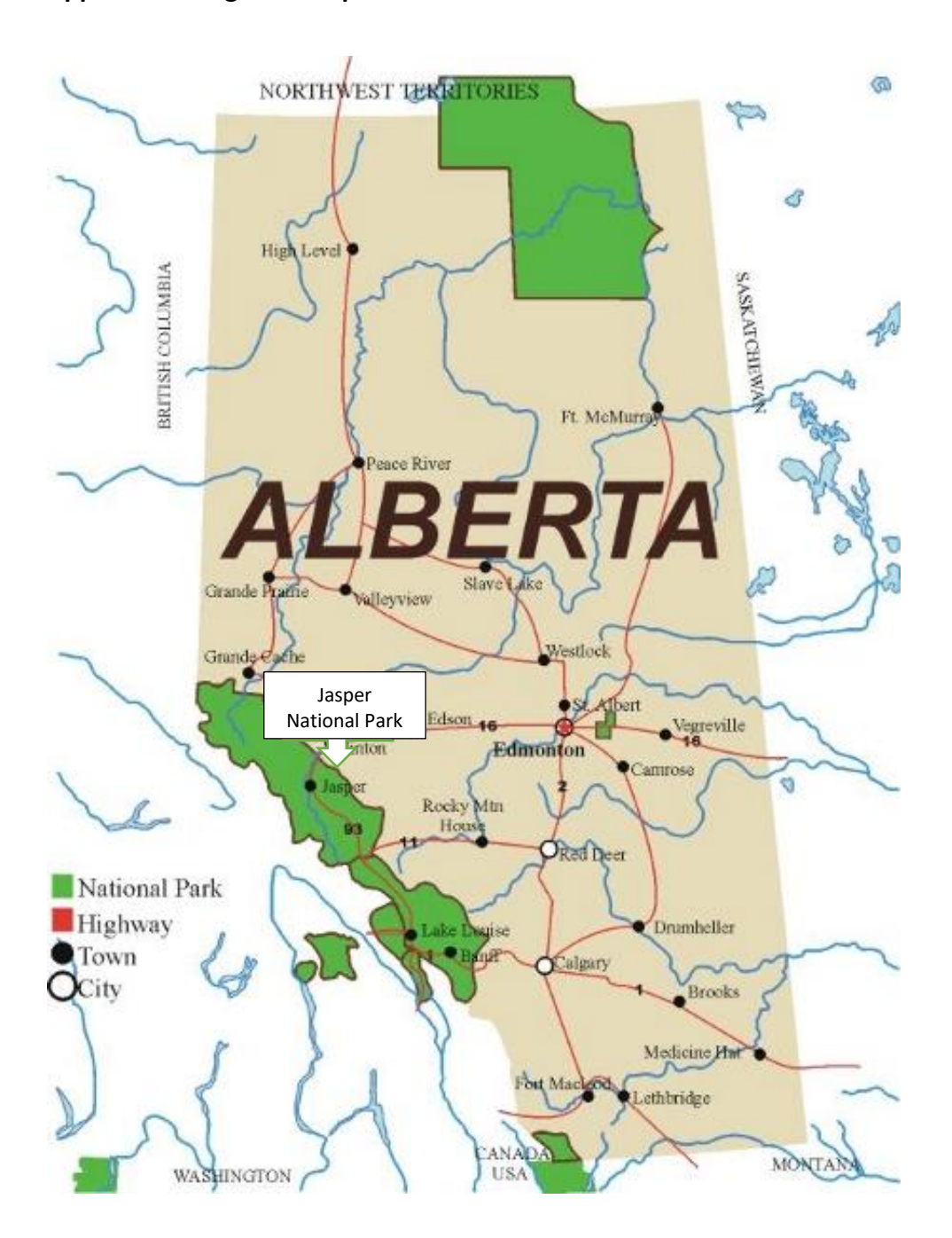
Appendix 2: Regional Map of Alberta – National Park Locations

Government of Canada. (2017). Map of Alberta – Jasper National Park . [image]. Retrieved from https://www.pc.gc.ca/en/pn-np/ab/jasper/visit/depliants-brochures/alberta