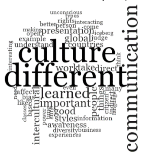
Figure 2 Word Cloud of Survey Responses

Overall, survey responses provide evidence of Impact, some evidence of Engagement, and some identification of barriers to intercultural understanding; therefore, mission fulfilment for indicator 2.2 was minimally achieved.