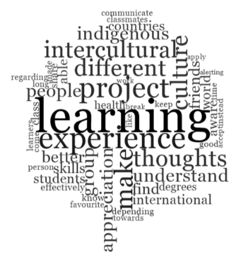
Figure 1 Word Cloud from Narrative Data

Engagement: Analysis of the engagement statements addressed the mechanisms or conditions that positively influenced engagement in intercultural learning. Four main themes emerged as influences: Professors, Curricular, Co-curricular, and Peers. The data provided evidence that student intercultural learning is taking place both inside and outside the classroom; however, engagement takes place primarily through structured and facilitated learning (e.g., coursework or ambassador programs). Note: 2020-21 all learning was online and in future years we will likely see more engagement in events that normally take place on campus.